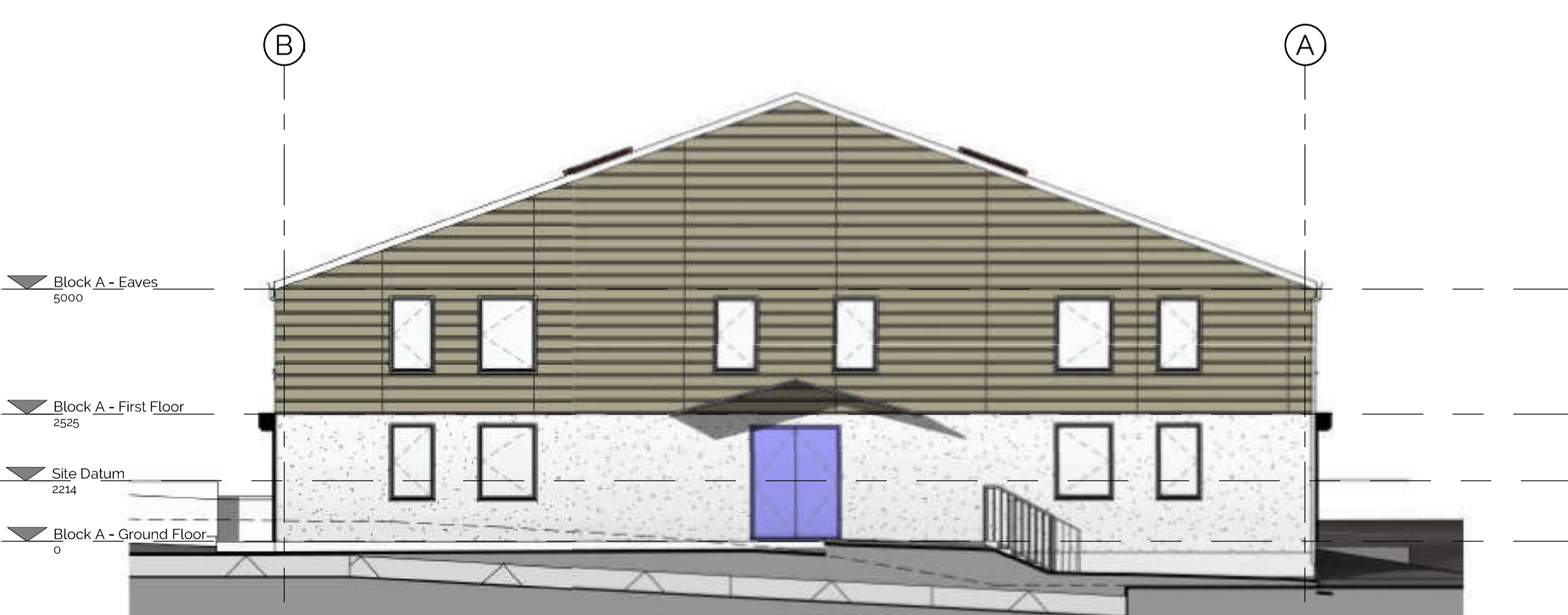
4 Block A - Elevation 4 1:100