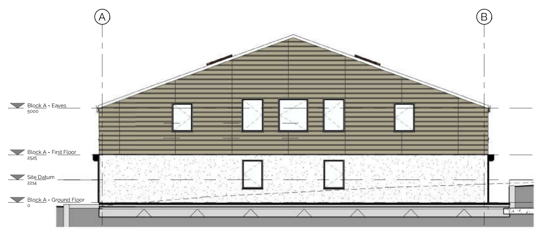
3 Block A - Elevation 3 1:100