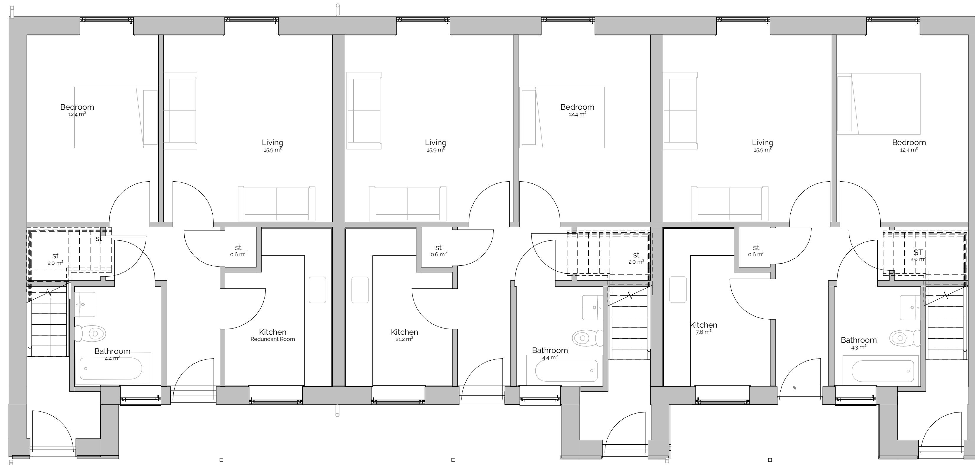
1 GA-Ground floor 1:50