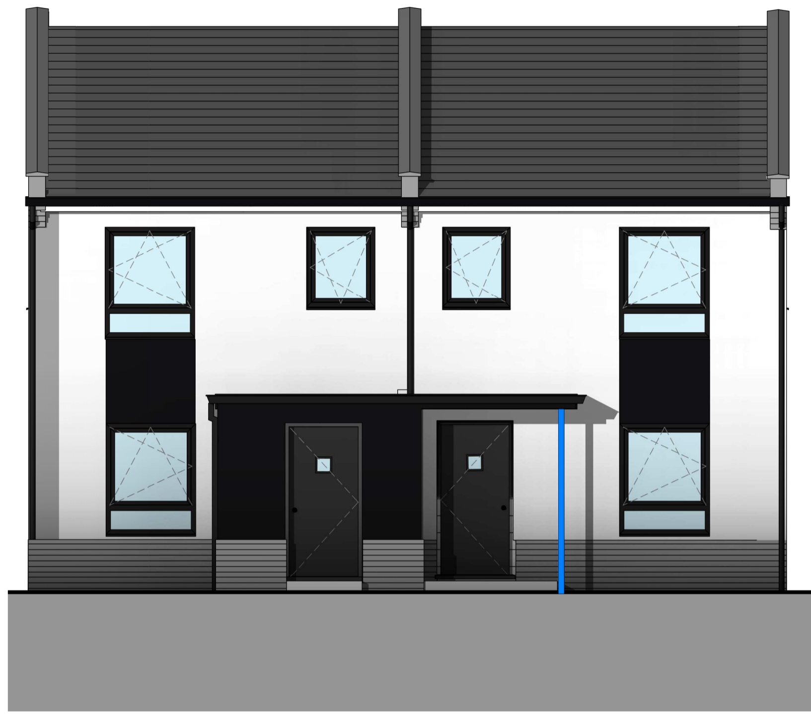
1 Elevation 1 - a 1:50