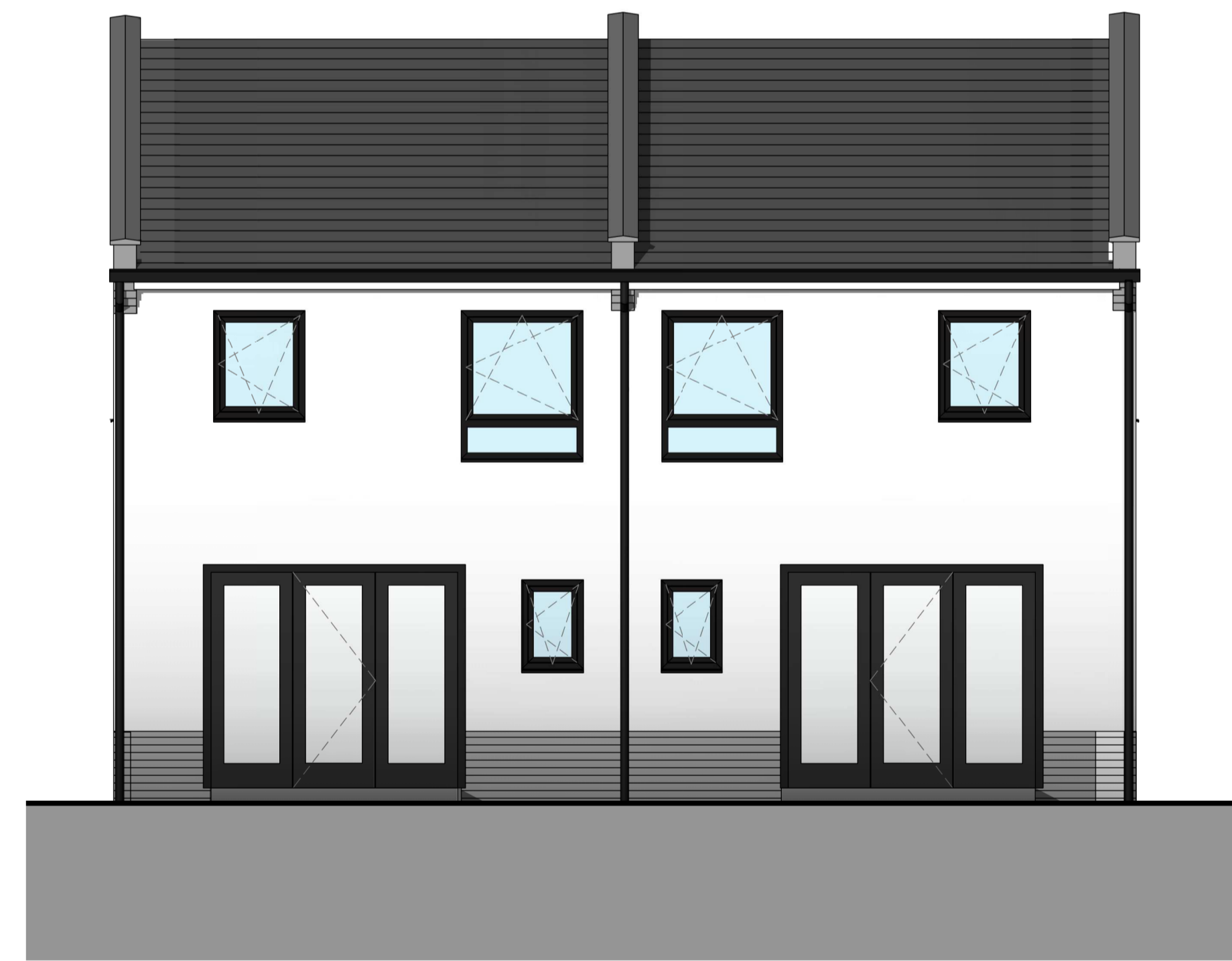
4 Elevation 4 - a 1:50