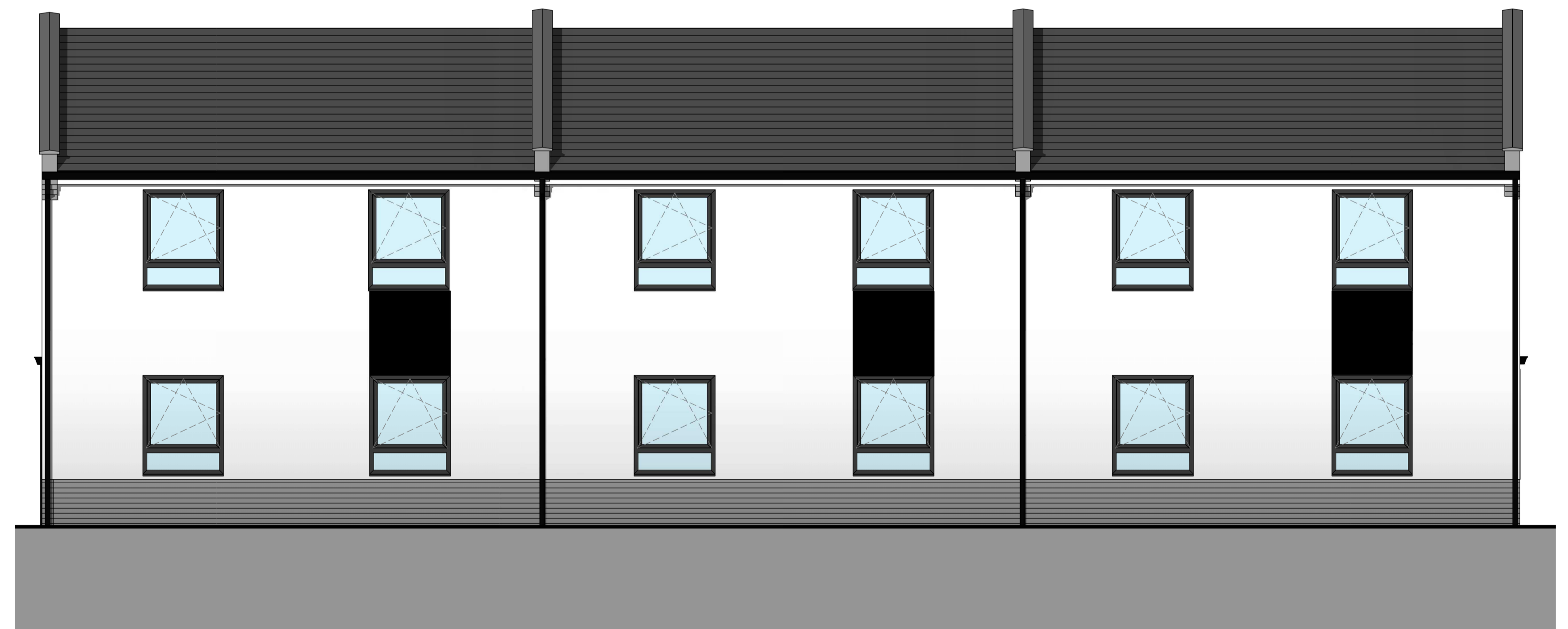
4 Elevation 4 - a 1:50