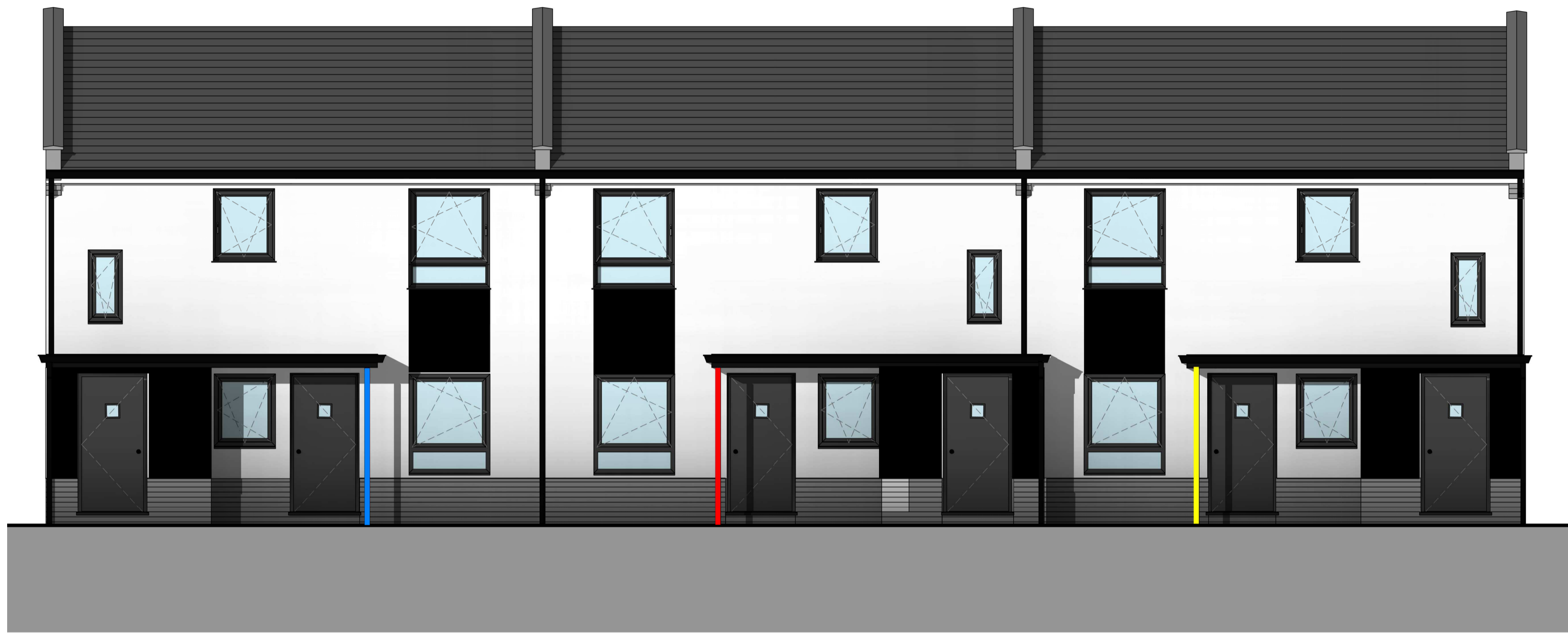
1 Elevation 1 - a 1:50