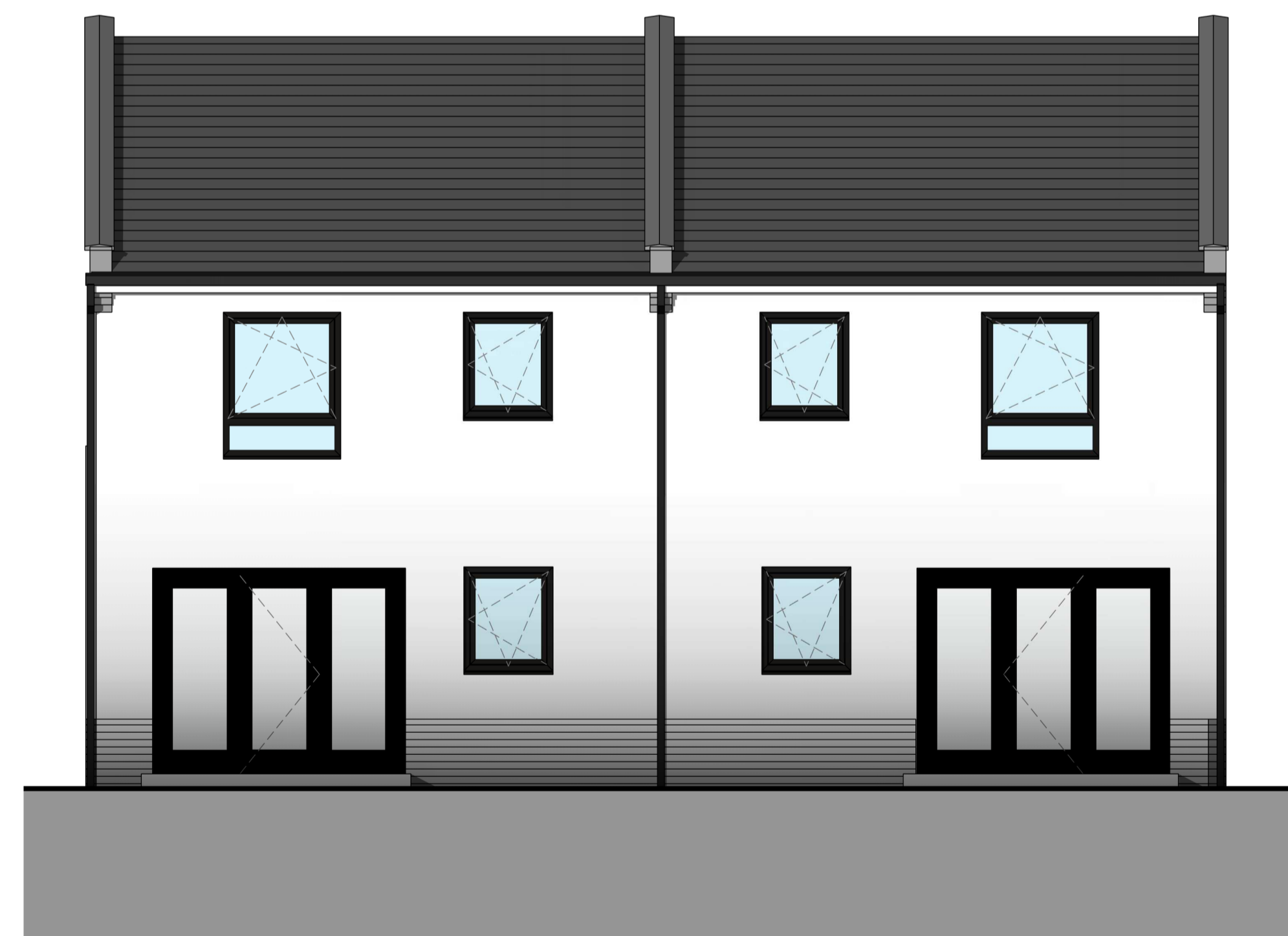
4 Elevation 4 - a 1:50