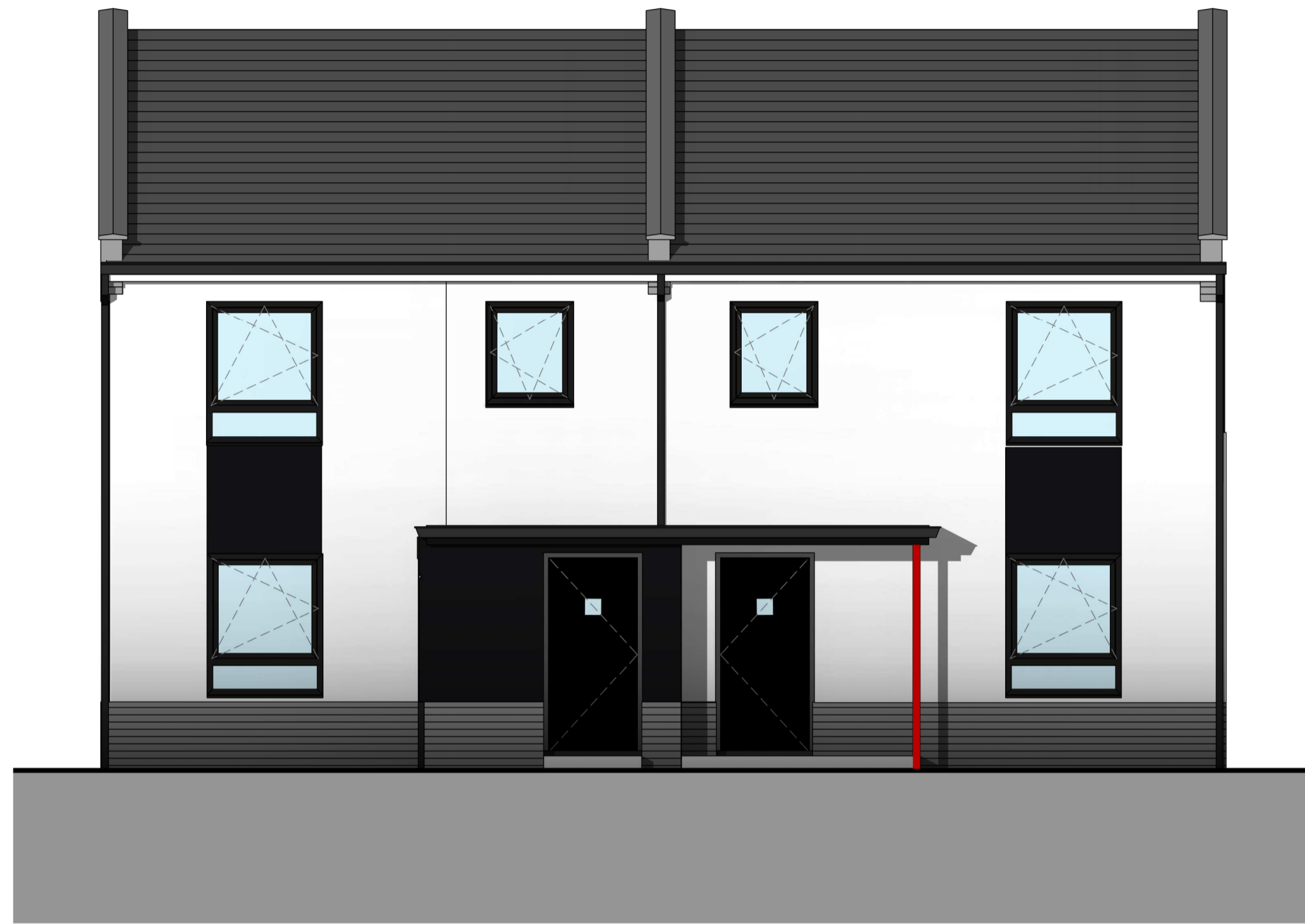
1 Elevation 1 - a 1:50