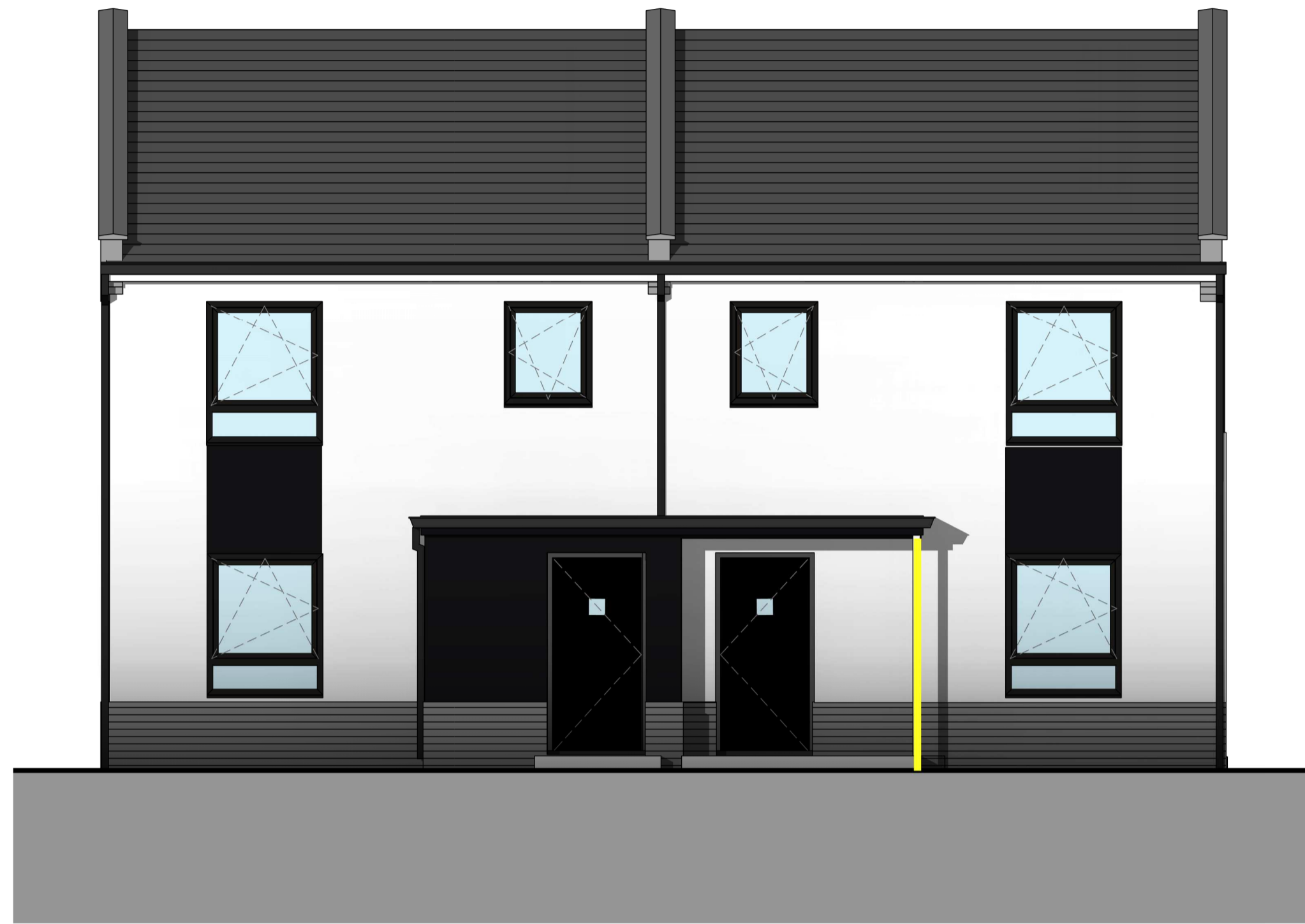
1 Elevation 1 - a 1:50